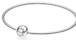
Signature Clasp Bangle

6.3 in 6.7 in 7.1 in 7.5 in 7.9 in 8.3 in 16 cm 17 cm 18 cm 19 cm 20 cm 21 cm