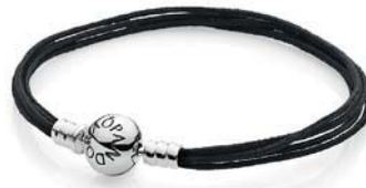
Multi-Strand Cord (M)