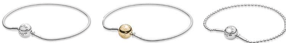
Signature Clasp Bracelets

6.3 in 6.7 in 7.1 in 7.5 in 7.9 in 8.3 in 16 cm 17 cm 18 cm 19 cm 20 cm 21 cm